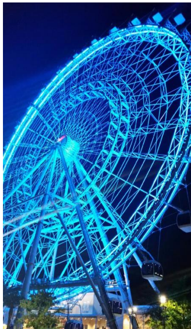
The Orlando Eye in TEAL!

support for victims in Central Florida. So far this year, our Crisis Response Team has responded to 176 sexual assault cases, a 13% increase from last year. While we have already seen an increase, we are gearing up for another increase over the summer months. Every summer, VSC sees a spike in the number of sexual assaults in Central Florida.